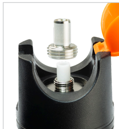
Close-up of cable adaptor fitted in tip